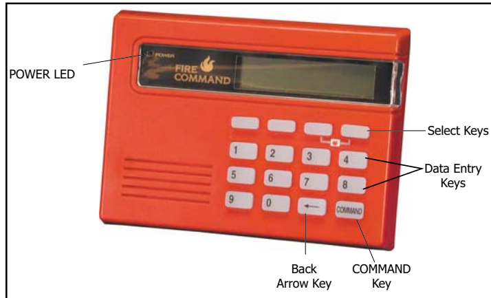
690F Fire Command Keypad

This device has been placed on the premises to allow you to properly operate the system and review previous event history. The keypad provides a passcode protected User Menu where you can access the functions needed to operate the system. See Keypad User Menu . In addition to the User Menu, the items below list operational features of your keypad.