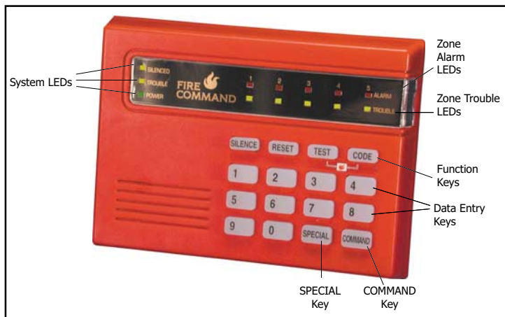
Figure 2: 692F LED Keypad

This device has been placed at locations throughout the premises to allow you to properly operate the system.